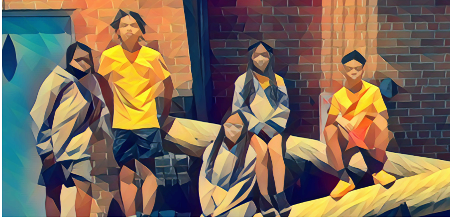
Youth from Inspiring Minds, a Community Investment grantee, attend an industry day and tour of the Wean Foundation in 2023.

Percent of Community Investment Grant dollars awarded to Black, Hispanic or Latinx-led organizations